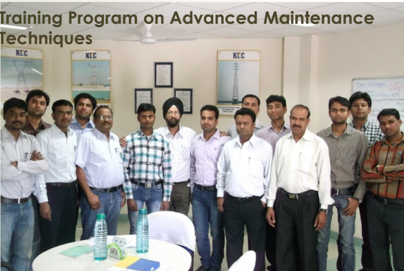
Training Program on Advanced Maintenance Techniques