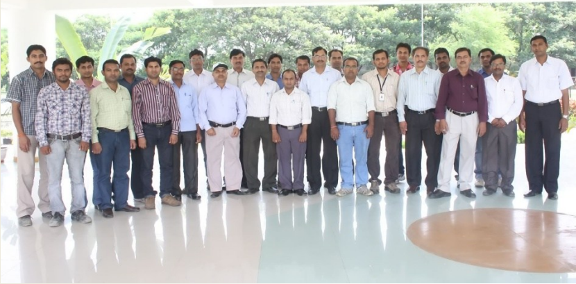
Training Program on HT/LT Motor