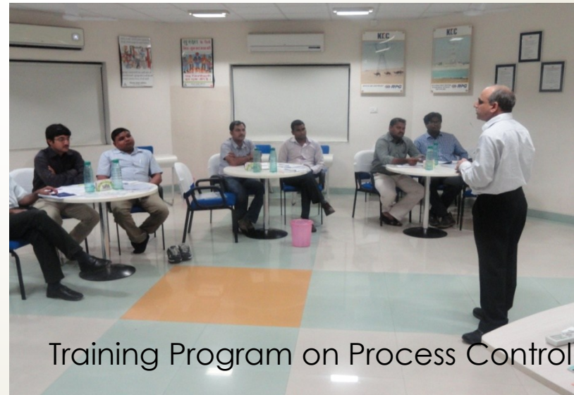
Training Program on Process Control