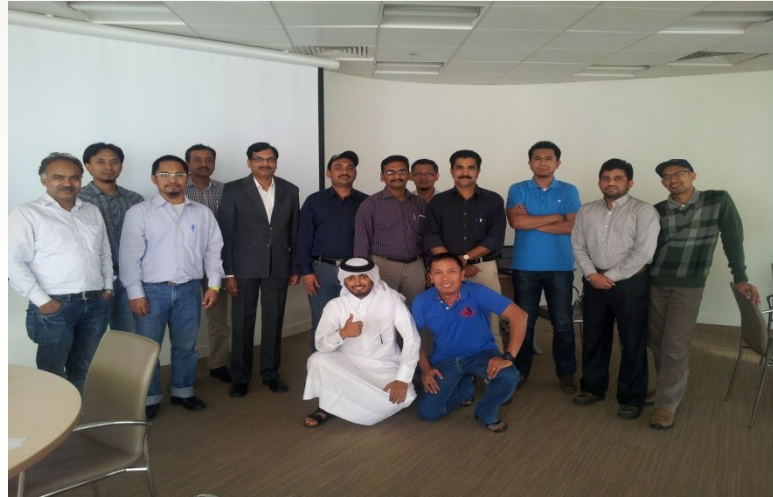
Training Program on Electrical Power System, Doha, Qatar